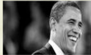
PRESIDENT BARAK OBAMA

Drug Control Policy), and the U.S. Global AIDS Coordinator – have not been announced.